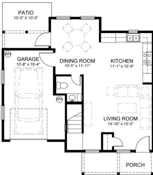
PROPOSED PLAN A-4