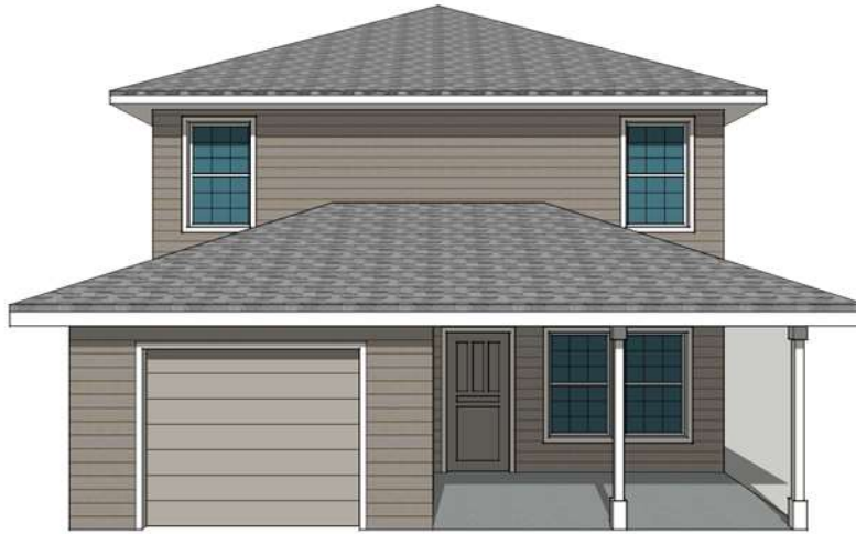
PROPOSED ELEVATION A-5