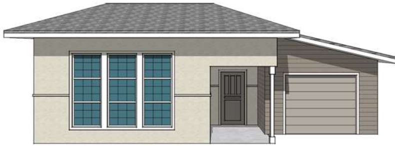
PROPOSED ELEVATION B-3