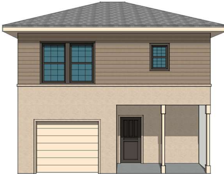
PROPOSED ELEVATION B-4