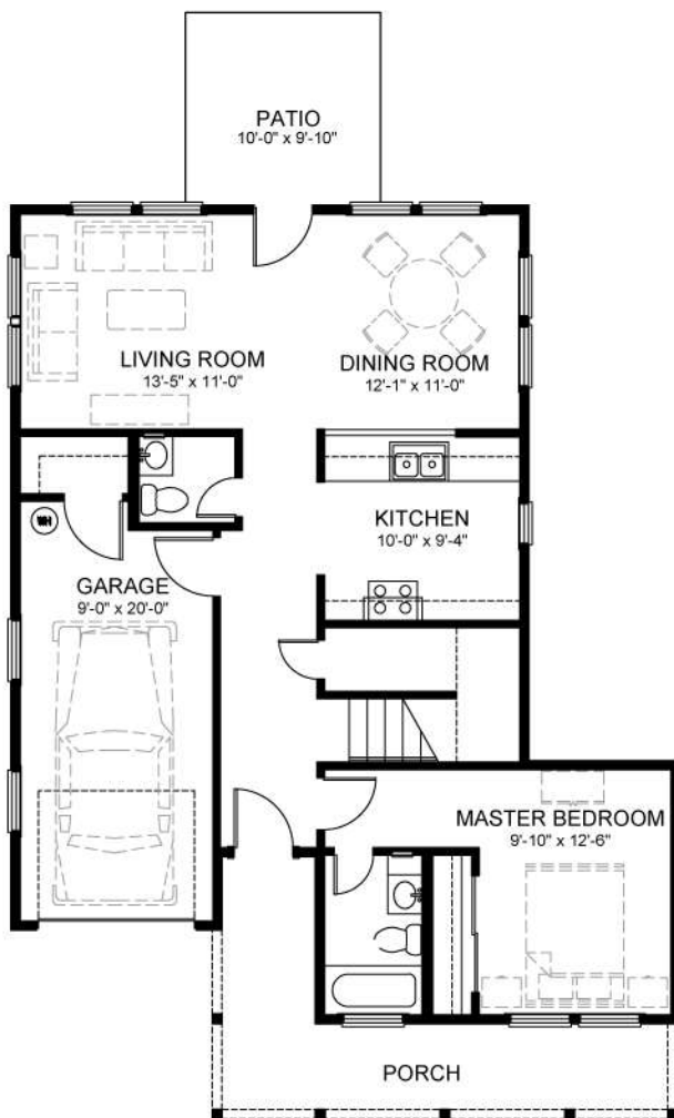
PROPOSED PLAN B-5