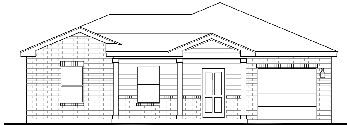
FRONT ELEVATION - A